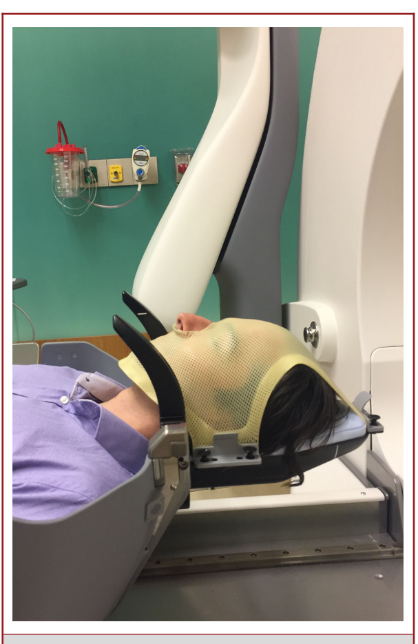
FIGURE 1. Patient position in headrest and thermoplastic mask. The photograph pictured is used with consent.

weight, adding/removing sector blocking, or adding/removing entire shots. During this time, the mask has hardened on the patient's face.